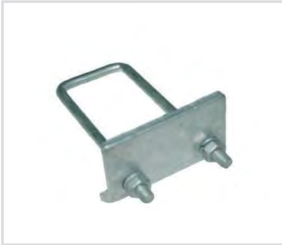
Art. 8636 CorSTRUT rail beam clamp