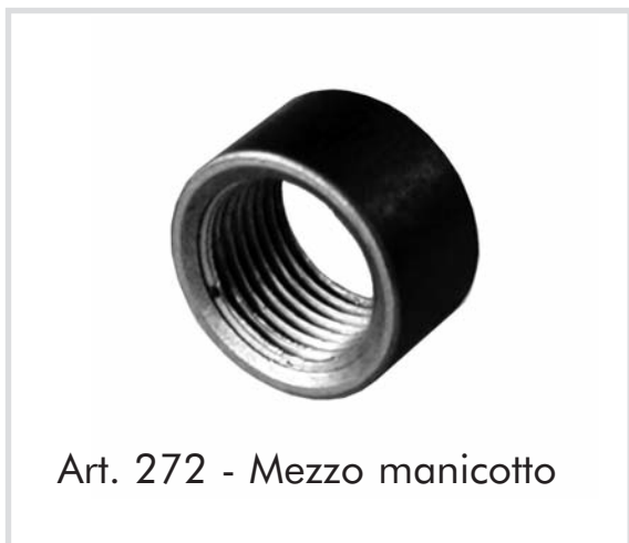
Art. 272 - Mezzo manicotto