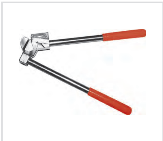
Art. 124001 Pliers to form the strip