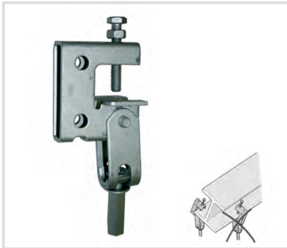
Art. 988000 Tiltable beam clamp