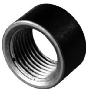
Art. 272 - Mezzo manicotto