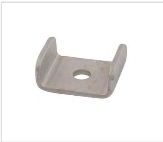
Art. 9016R C-washer for CorSTRUT fixing rail - AISI 316