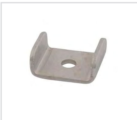
Art. 9016R C-washer for CorSTRUT fixing rail - AISI 316