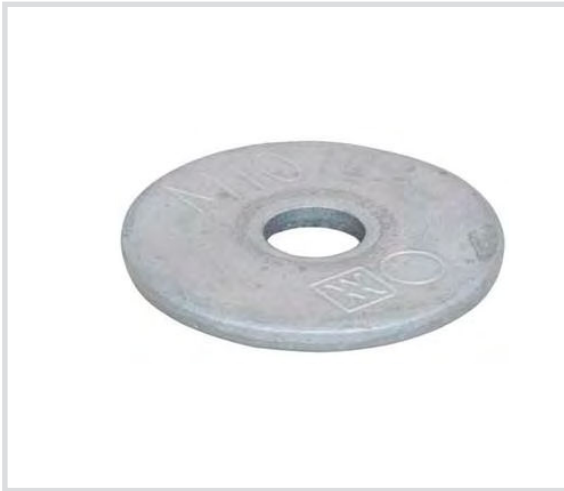
Art. 901R CorSTRUT flat washer - AISI 316